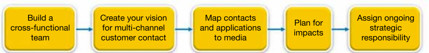
Figure 2. Multi-channel Strategy Planning Process

This exercise gives you a sense for the breadth of customer “touch points” as well as the range of players who need to participate in strategy development. As indicated in Figure 2, cross-functional participation and collaboration are prerequisites to success. The multi-channel strategy needs the silos to come together and work on behalf of the customer and the company.